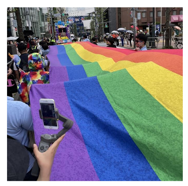
A 15 meter (50 foot) rainbow flag leading the Tokyo Rainbow Parade 2022.

Ultimately some 2,000 people (pre-registered due to COVID19 limitations) took part in the Tokyo Rainbow Parade 2022 which wound through the streets of Tokyo, at one time walking across the famed Shibuya scramble crossing. Led by TRP co-chairs and the Youth Pride Japan ( (new TRP project of young members in their teens and 20s) the parade signaled its will to "Change the Future" for future generations. Braving the gradually strengthening rain, crowds also gathered to cheer them on, waving rainbow flags and shouting "Happy Pride" from their store fronts.