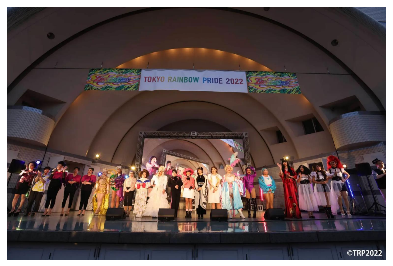
Stage finale at the Tokyo Rainbow Pride Festival Sunday April 24, 2022.

All in all, while there were a few hiccups here and there that the organizers promised to learn from for following Pride festivals, the three days ended without any major incidents.