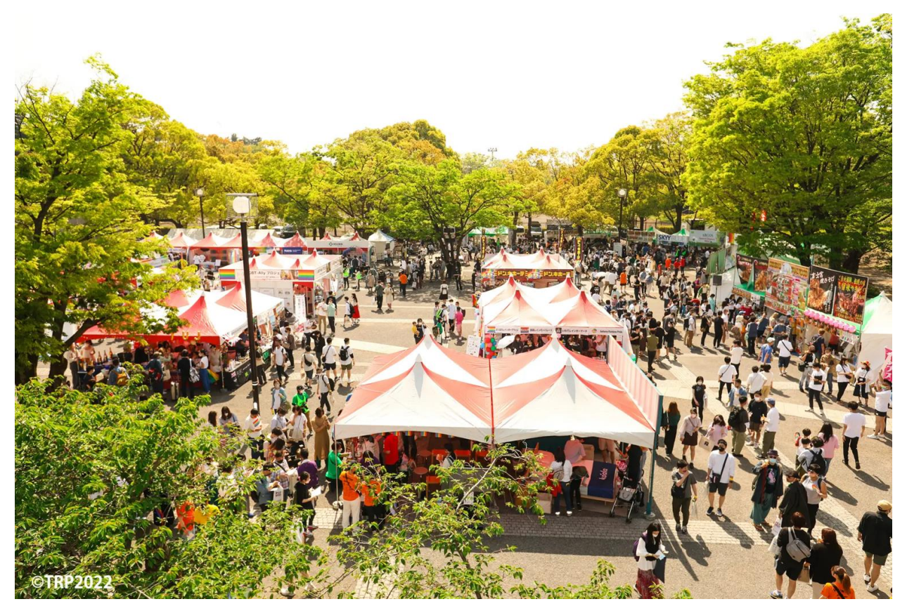
Booths of the Tokyo Rainbow Pride Festival line the Yoyogi Event Plaza April 22-24, 2022.

Over the three days of the Tokyo Rainbow Pride Festival 2022 April 22 through 24, some 66,000 thousand people flocked to Tokyo's Yoyogi park to reconnect and re-energize their fight for LGBTQ+ rights and recognition.